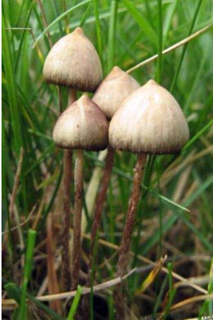
Psilocybe semilanceata (Fr.:Secr.) P. Kumm.