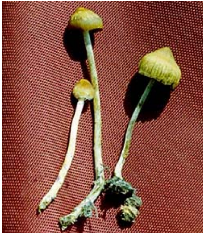
Fig. 1. Psilocybe samuiensis Guzmán, Bandala & Allen.