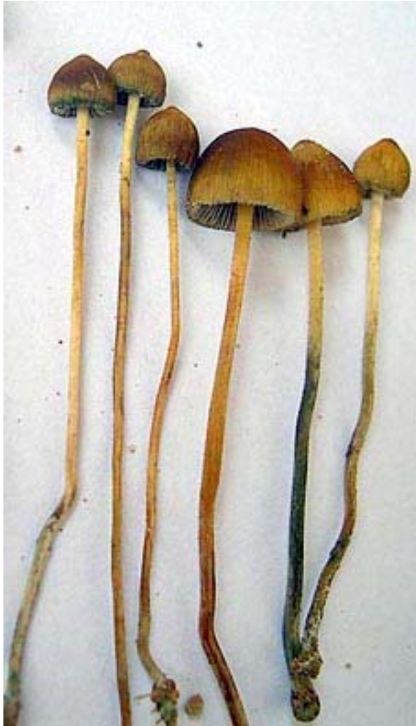
Psilocybe antioquensis - Angkor Wat Cambodia