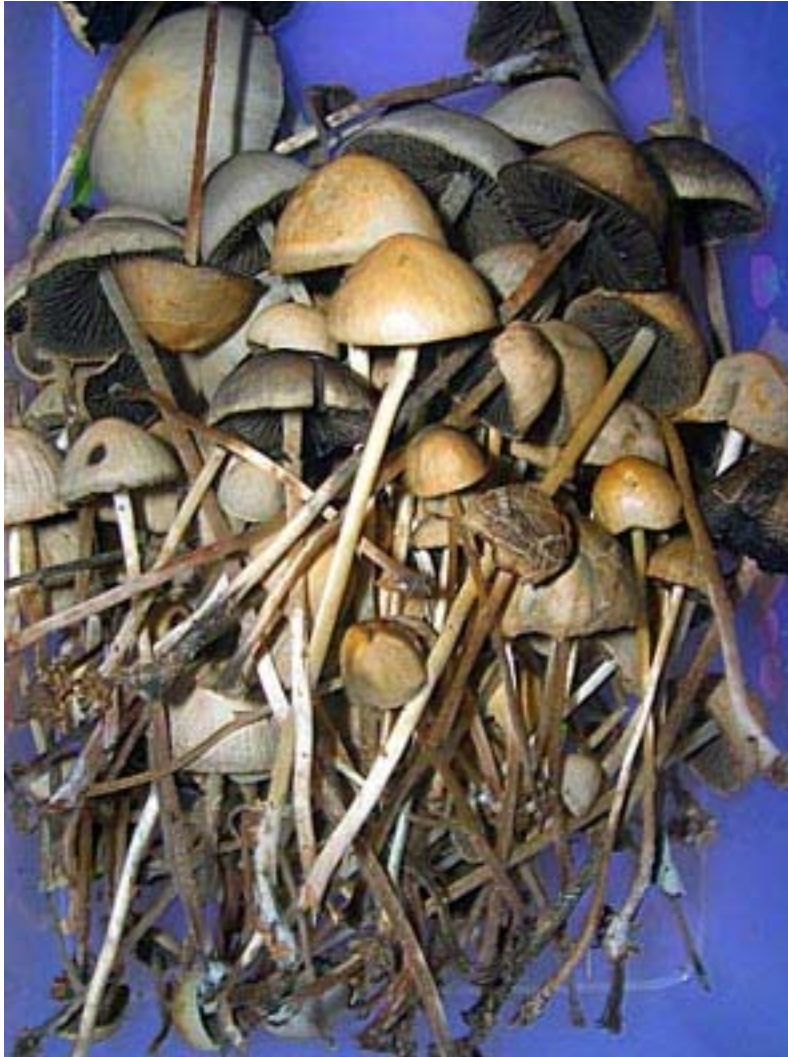
One Half hour of picking Copelandia cyanescens at the Ban Thurian Buffalo (Kwai) Arena. Koh Samui, Thailand.