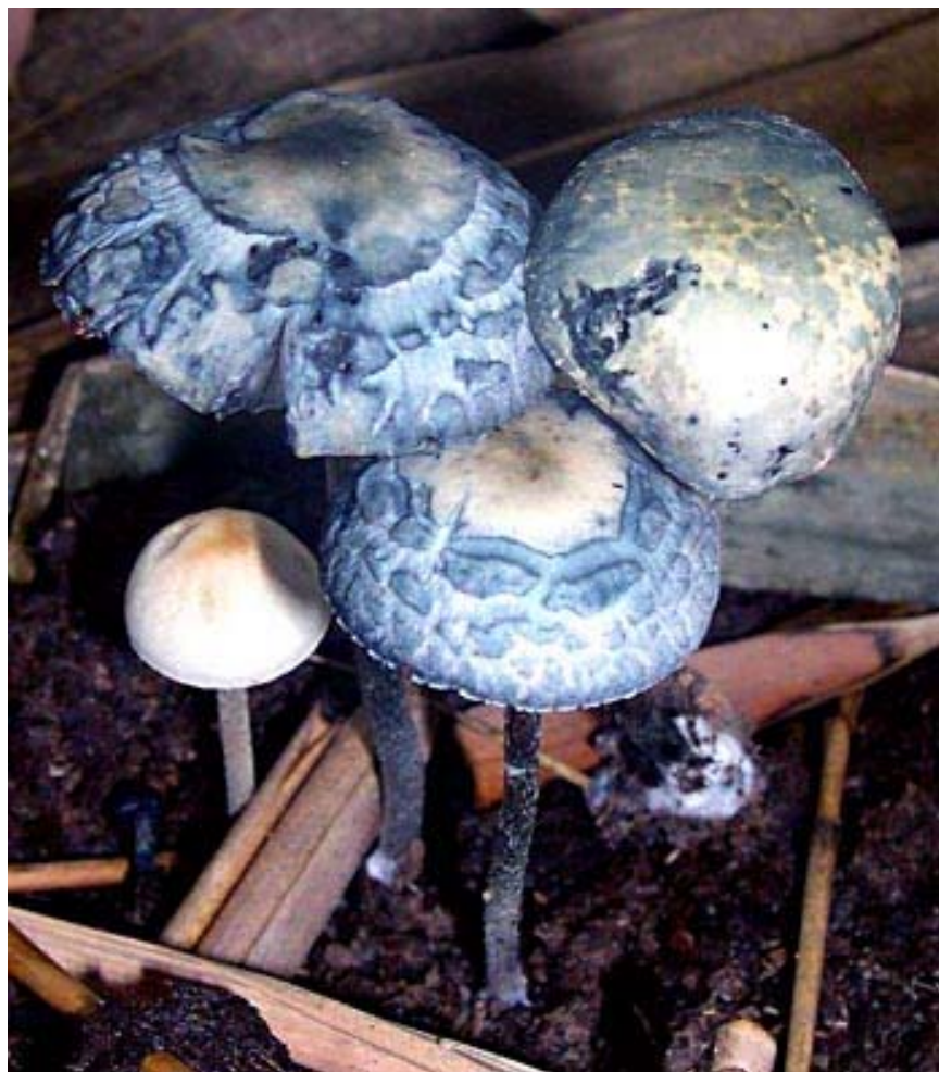
Natural Bluing in Copelandia cyanescens At Ban Nathon, Koh Samui, Thailand, Monastery