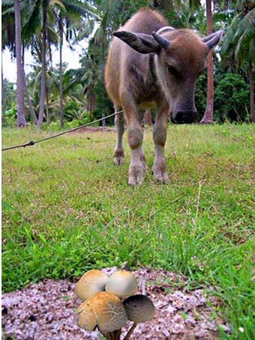
Copelandia cyanescens (Berk. & Br.) Singer Ban Phang Ka, Koh Samui, Thailand.