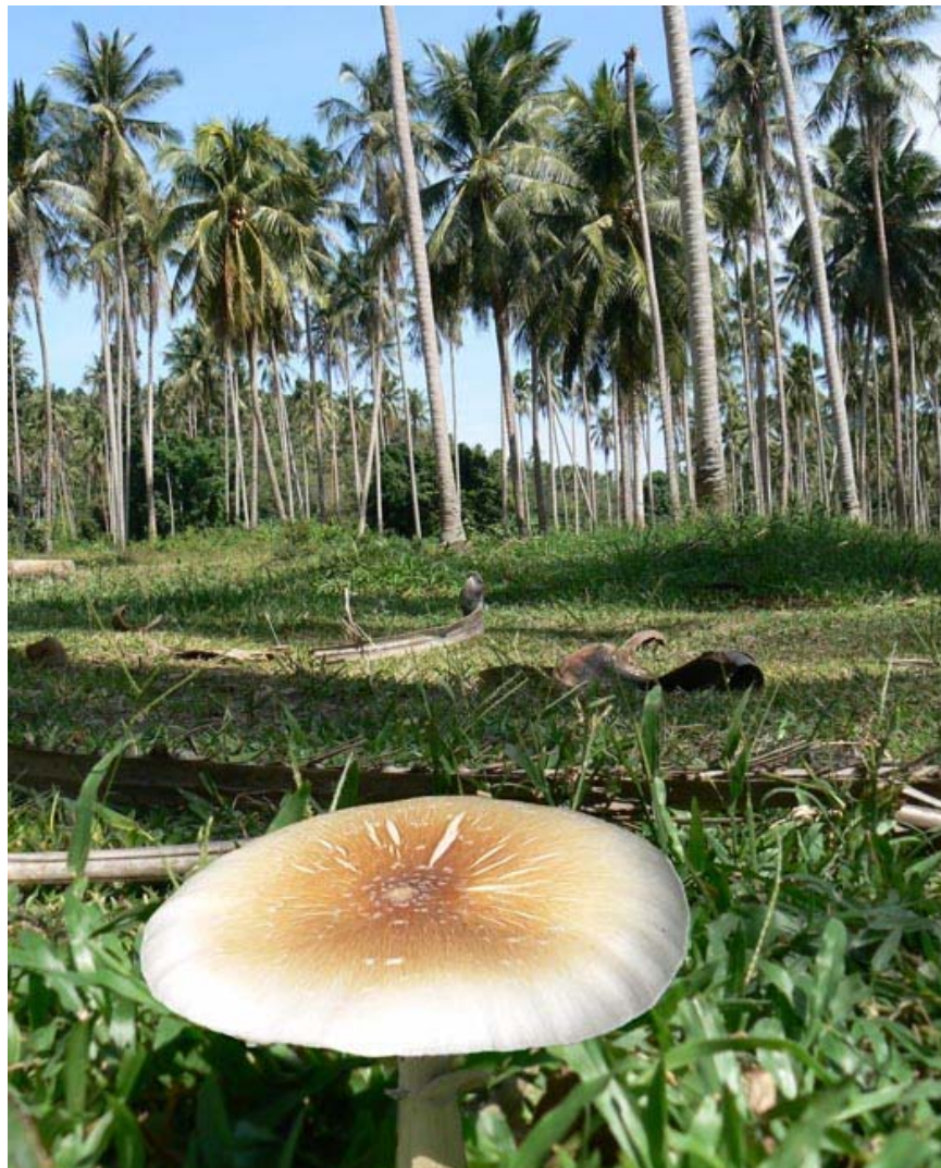
Psilocybe cubensis (Earle) Singer