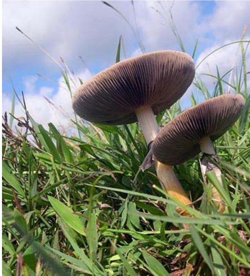
Psilocybe cubensis - Na Muang Rice Paddie, Koh Samui, Thailand